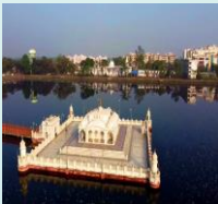
Pawapuri Water temple